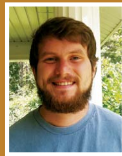
Rhett Butler Eclectic, AL Duke